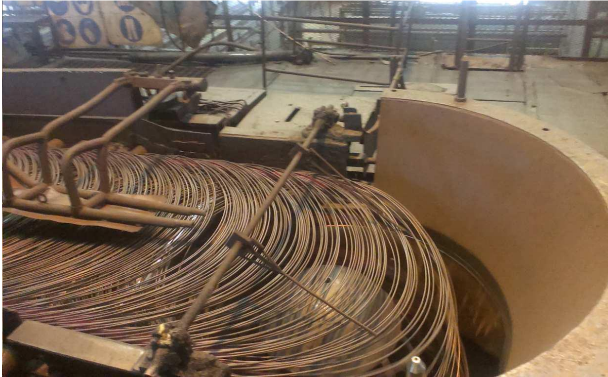
Figure 2 Coil entering vertical Mandrel