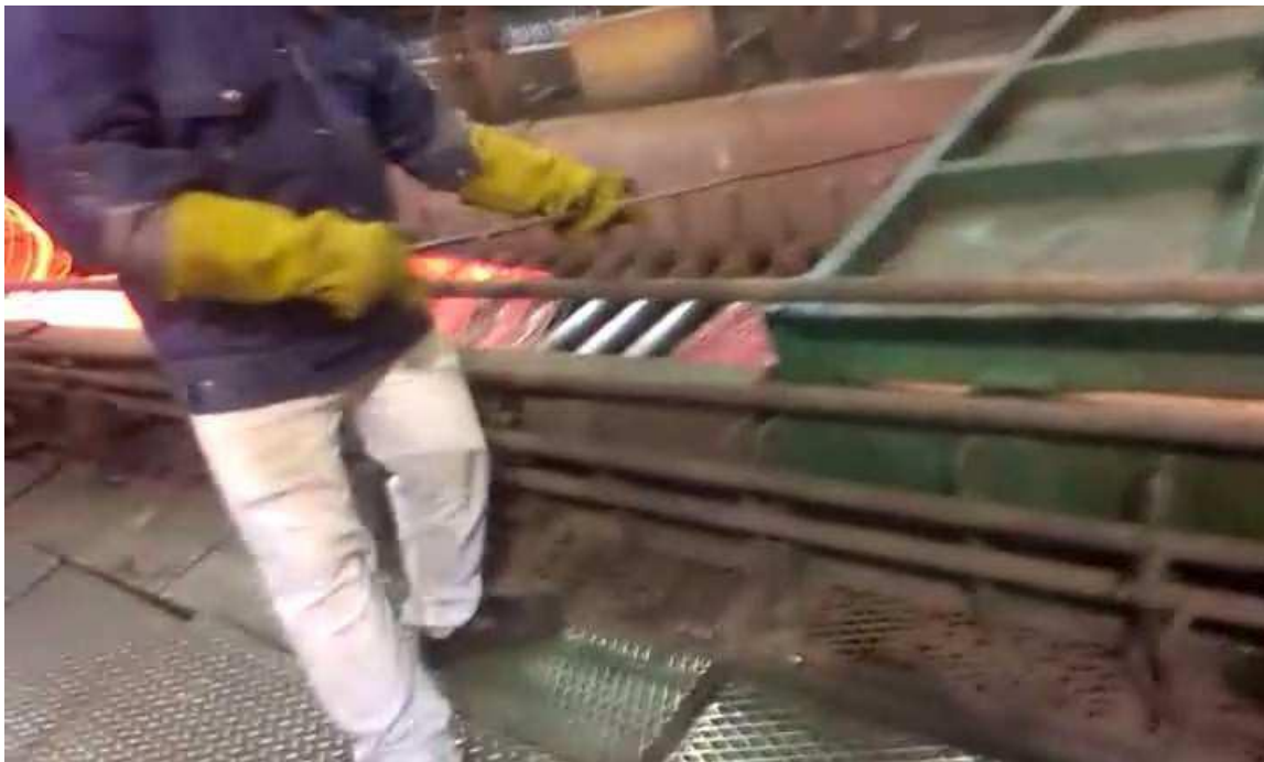
Figure 4 Operator lifting the tail end and aligning