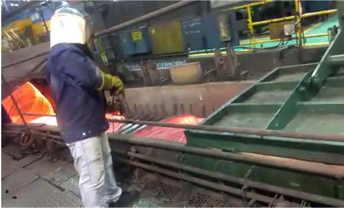
Figure 3 Operator aligning the tail end of the coil using a tool